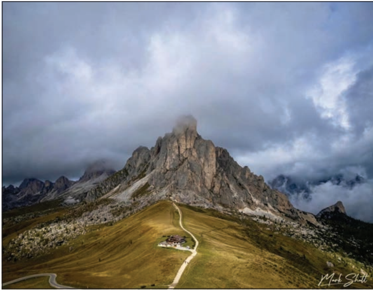
Passo Di Giau Italy